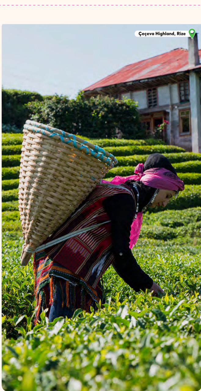
Turkish tea culture is included in the UNESCO Intangible Cultural Heritage list.

Trabzon is an important hub of both cultural and local cheese varieties, and of course, a glass of Turkish tea! The city is home to some iconic landmarks that are a must-see. Nestled on a steep cliff at an altitude of 1200 meters above the sea, the historical Sümele Monastery is significant for its beautiful frescoes depicting the story of Jesus and the Virgin Mary. Foodies should keep an eye out for Sümele where most authentic breakfast experiences in the region, accompanied by tasty Turkish tea. The famous Vakkıbeir bread, with its thick outer crust, is a popular staple for those looking to sweeten their glass of tea with the world's most unique honey: Anzer Honey. This honey, made from hundreds of endemic plants from the region, is high in anti-oxidants and is thought to cure a variety of ailments. Trabzon offers some of the most authentic breakfast experiences in the region, accompanied by tasty Turkish tea. The famous Vakkıbeir bread, with its thick outer crust, is a popular staple for those looking to sweeten their glass of tea with the world's most unique honey: Anzer Honey. This honey, made from hundreds of endemic plants from the region, is high in anti-oxidants and is thought to cure a variety of ailments.