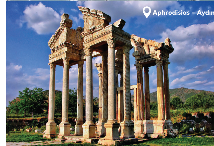
Aphrodisias - Aydin