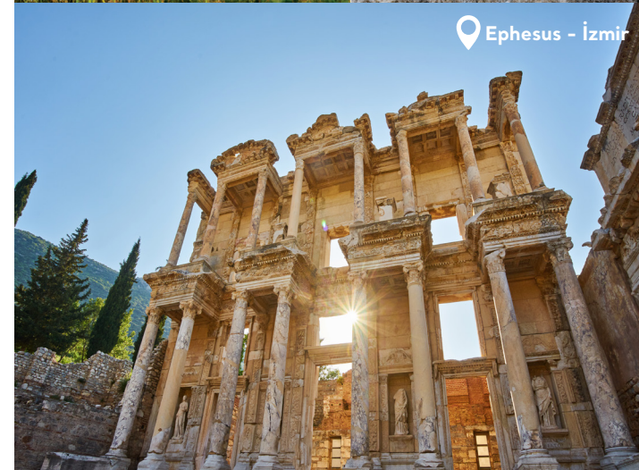
Ephesus - İzmir