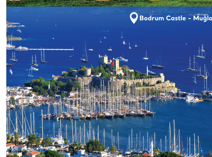
Bodrum Castle - Muğla

Slow down the pace of life, savour every moment and let yourself be inspired by all that the region offers.