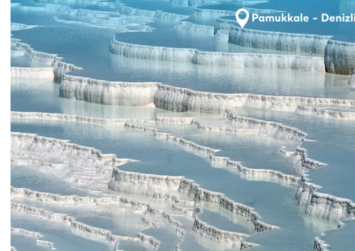
Pamukkale - Denizli

The Ancient City of Knidos is located at the furthest point of the Datça Peninsula where the Aegean Sea and the Mediterranean meet. Connected to the mainland with a narrow, sandy isthmus, all interior walls of the ancient city of Knidos is filled with archaeological remains. The ancient city's harbours are now popular anchorages for day cruisers and sailboats stopping for lunch, swimming, and visiting the city ruins.