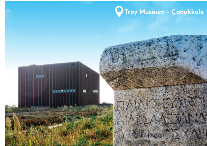
Troy Museum - Çanakkale

The ancient city of Ephesus , an archaeological site with peach orchards, olive groves and fertile lands with poplars as far as the eye can see, is on the UNESCO World Heritage Site List. The ancient city still reflects the glory of antiquity with its magnificent theatre still hosting concerts and events, the Celsus Library , well-preserved terrace houses, and the Temple of Artemis, which was one of the seven wonders of the ancient world. The floor mosaics of terrace houses represent the art and delicate aesthetics of the period.